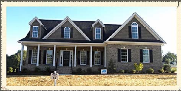
Above photo is similar to homes that will be built in Dawn Acres. Actual homes may vary.

Construction to begin soon! Don't miss out on this opportunity!